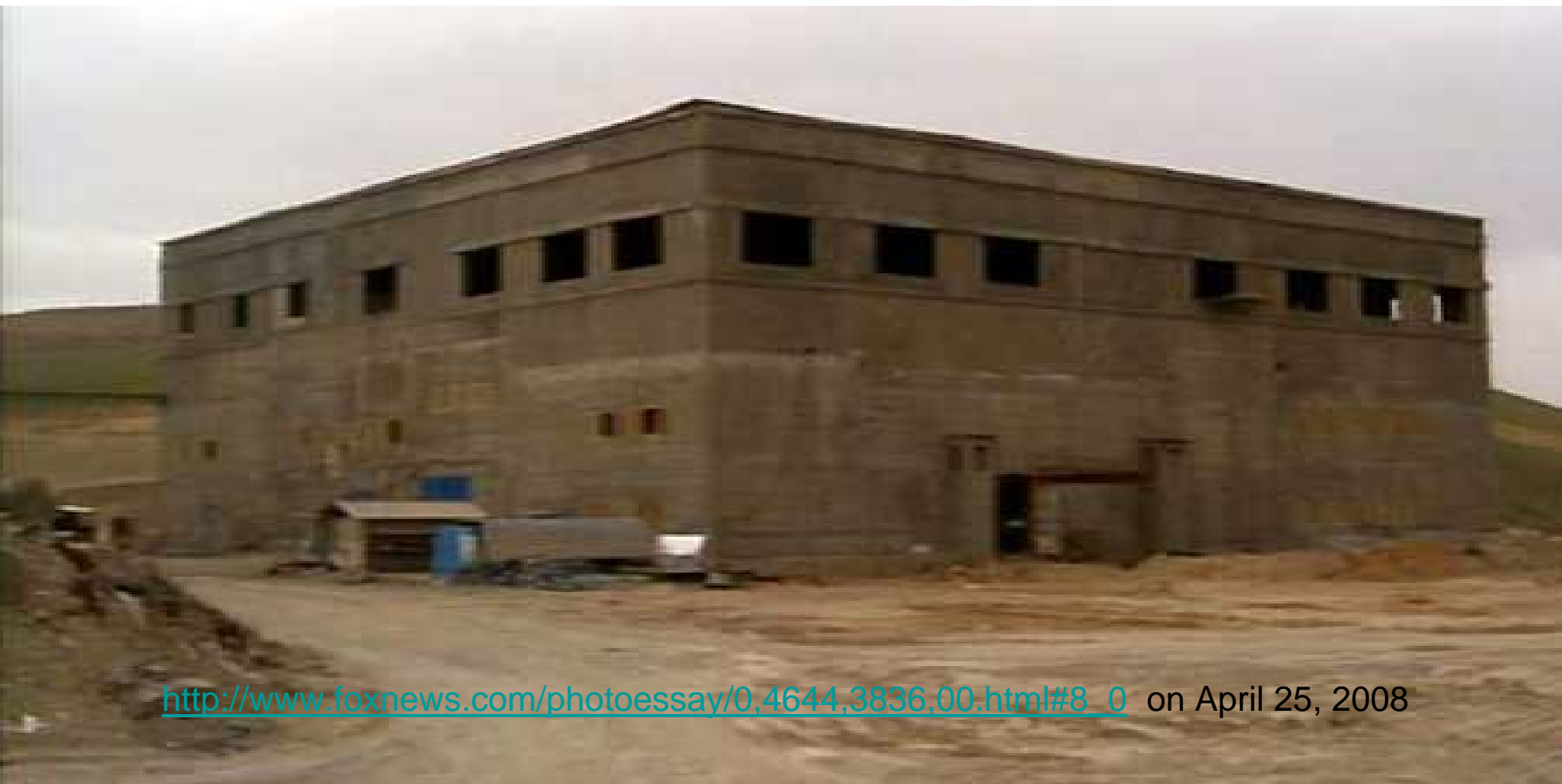
Photo of a covert nuclear reactor being built in Syria's eastern desert

http://www.foxnews.com/photoessay/0,4644,3836,00.html#8_0 on April 25, 2008